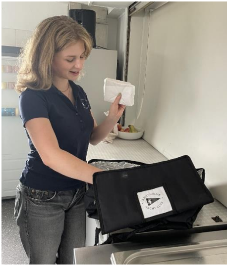
Boat crew sandwiches packed in paper, reusable cool bags and printed tote bags