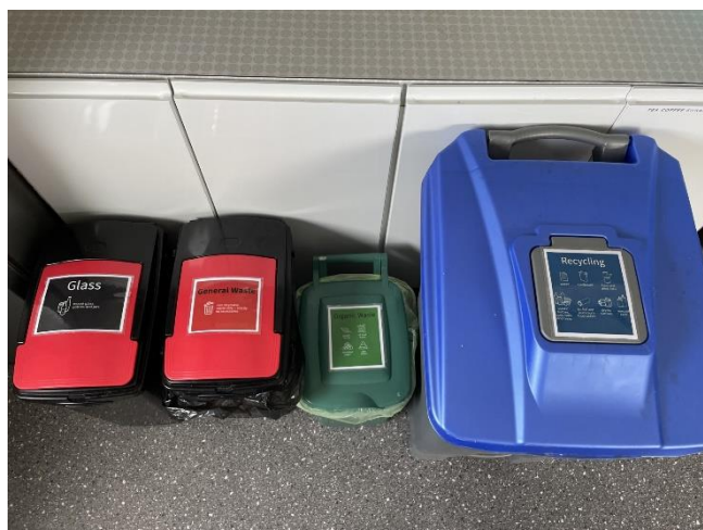
Outdoor seagull proof bins and indoor bins