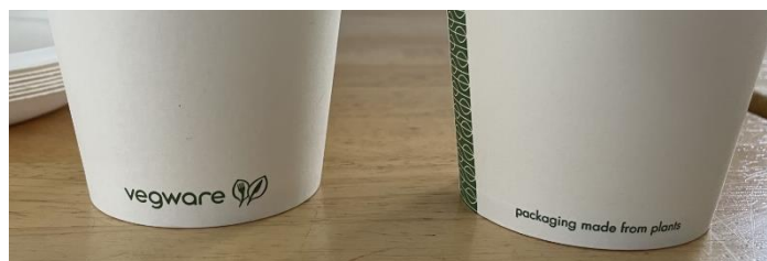
Compostable dinnerware and reusable mugs made by a BYC member