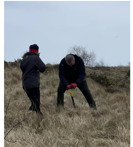
Tree Planting with the Woodland Trust at Cave Hill Belfast