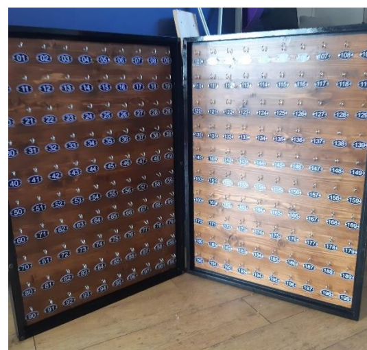
Wooden tags, battery recycling and wooden tally board