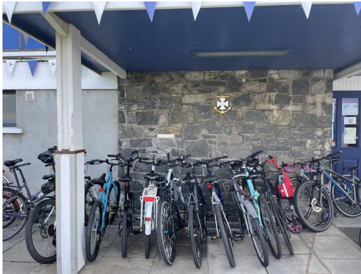
Bike rack in front of BYC Clubhouse