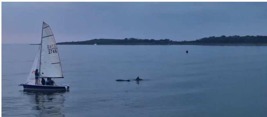
Keeping our seas clean for our local dolphins who join in the fun