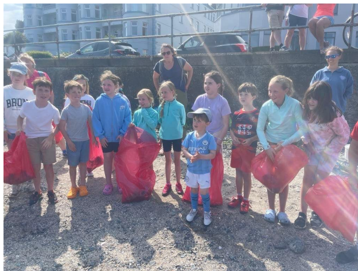
The children who took part in the beach clean