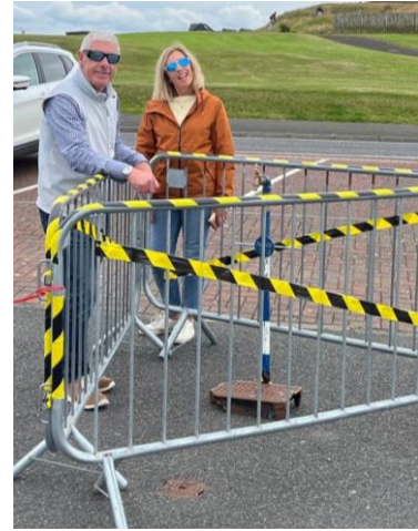
Sailor filling reusable water bottle, reusable coffee cup and installing the campsite water tap